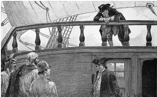
THE THREE FELLOWS WERE BROUGHT AFT TO THE QUARTER-DECK, WHERE CAPTAIN CROKER STOOD, JUST BELOW THE RAIL OF THE DECK ABOVE.

At first I was inclined to tell the real truth concerning them to Captain Croker, but on second thoughts I determined to see what the fellows had to say for themselves; for I only recognized one of them, and, after all, their story might be true, and that one have given up his wicked trade in the four or five months since I had last seen him.