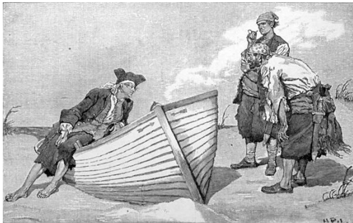
"I AM CAPTAIN JOHN MACKRA," SAID I, AND I SAT DOWN UPON THE GUNWALE OF THE BOAT.

"The devil you are!" says he, and he stared at me from top to toe as though I had been some strange creature the like of which he had never beheld before. Then, without another word, he put his fingers to his lips and gave a great, long, shrill whistle. I presently heard a great crackling in the bushes and the noise of loud voices, and soon there burst out of the thickets six or eight great, bearded, dirty, villanous rascals, who came running down to the boat, having caught sight of me, and knowing me to be a stranger. "It's Captain Leach," said the one of the pirates who had not yet spoken—a young fellow of not more than twenty.