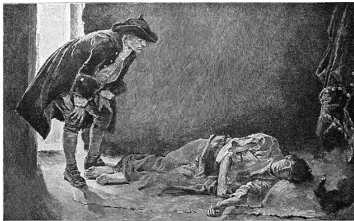
THERE, IN THE CORNER, I BEHELD THE FAMOUS PIRATE, CAPTAIN EDWARD ENGLAND.

Presently mine eyes became accustomed to the gloom, and I might see the things around more clearly. There, in the corner of the room, lying upon a mat of filthy rags, his body almost a skeleton, his bloodshot eyes glaring out from under his matted hair, I beheld the famous pirate, Captain Edward England.