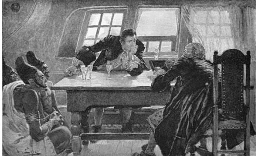
MR. LONGWAYS LOOKED UP UNDER HIS BROWN EYES AT ME WITH A VERY CURIOUS LEER.